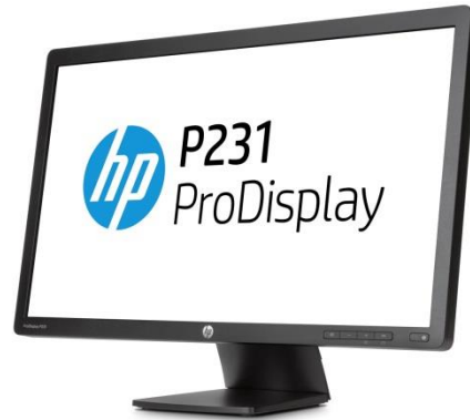
HP ProDisplay P231

Save money and be more productive with an essential business monitor that delivers solid performance, a massive 23-inch diagonal screen, and energy savings at a very attractive price point. Do more throughout the day and efficiently grow your business with a stylish monitor that has proven HP quality and reliability, a stable lifecycle, and HP accessory compatibility.